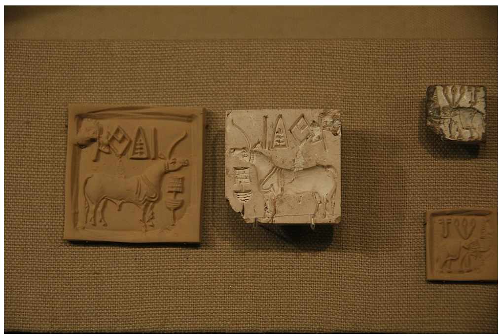
Stamp seals from Harappa engraved with images of animals on display at The Metropolitan Museum of Art, New York

On the other hand, productive and constructive knowledge needs to be taught at two levels to produce concrete results. First, it needs to be explained theoretically and has to be memorised by the younger generation. At the second stage, it needs to be tested in the field. A senior pot maker first teaches a younger person the principles of how to make a pot, which then needs to be verified in practice — whether that method really produces a pot. Agrarian production needs a concrete study of the relationship between soil and seed in each geographical context. It does not give practical results merely from memorising the method of cultivation. That knowledge has to be tested in the praxis.